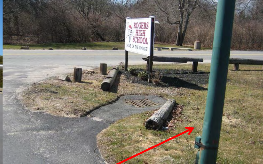
Rain garden planting area at Ruggles entrance: before installation