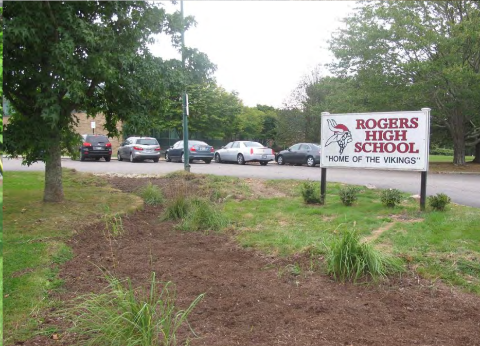
Rain garden installed June 2012, planting not complete