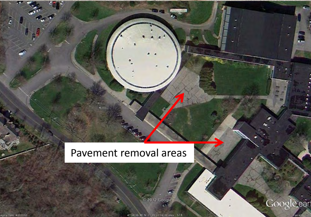
Pavement removal areas