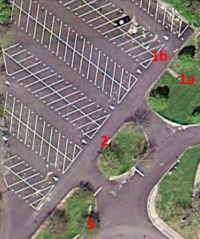
Rain Garden Sites: Western Parking area