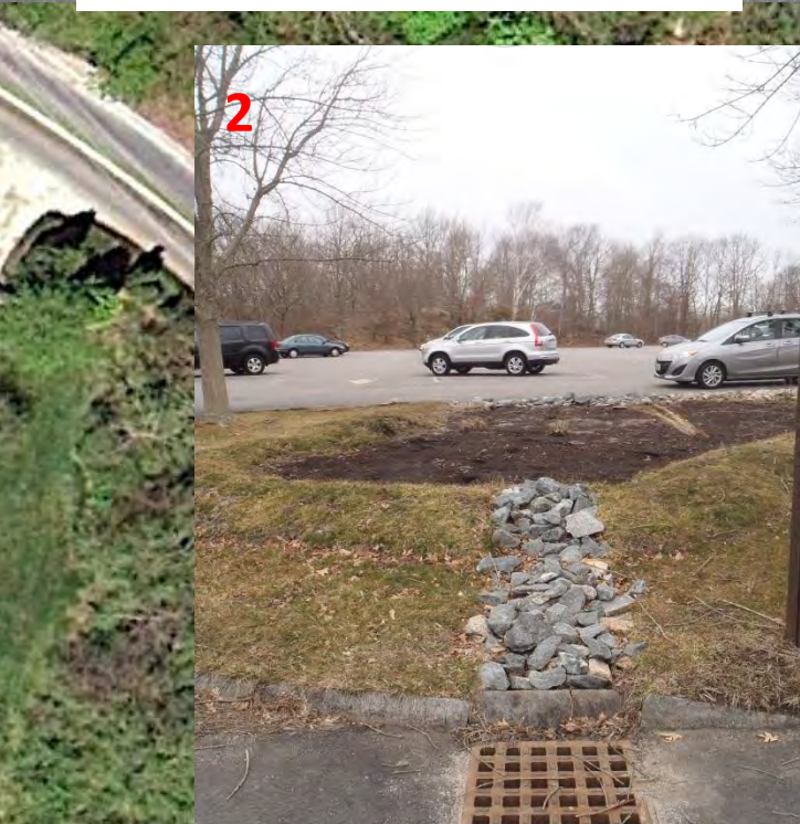
Rain garden after installation