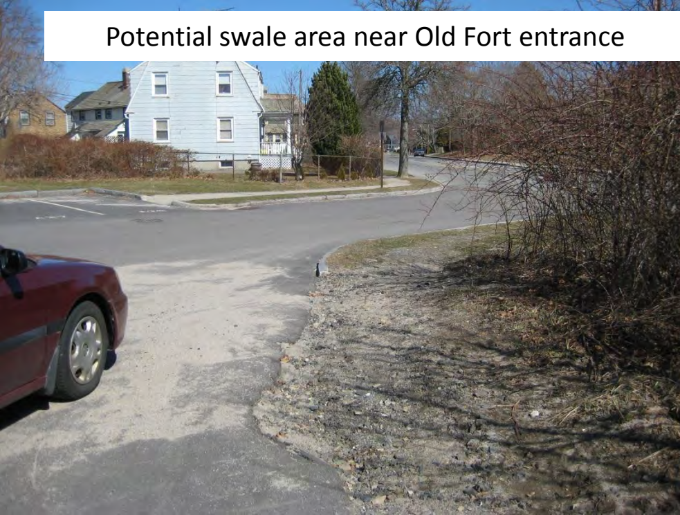
Potential swale area near Old Fort entrance