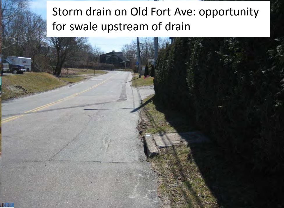
Storm drain on Old Fort Ave: opportunity for swale upstream of drain