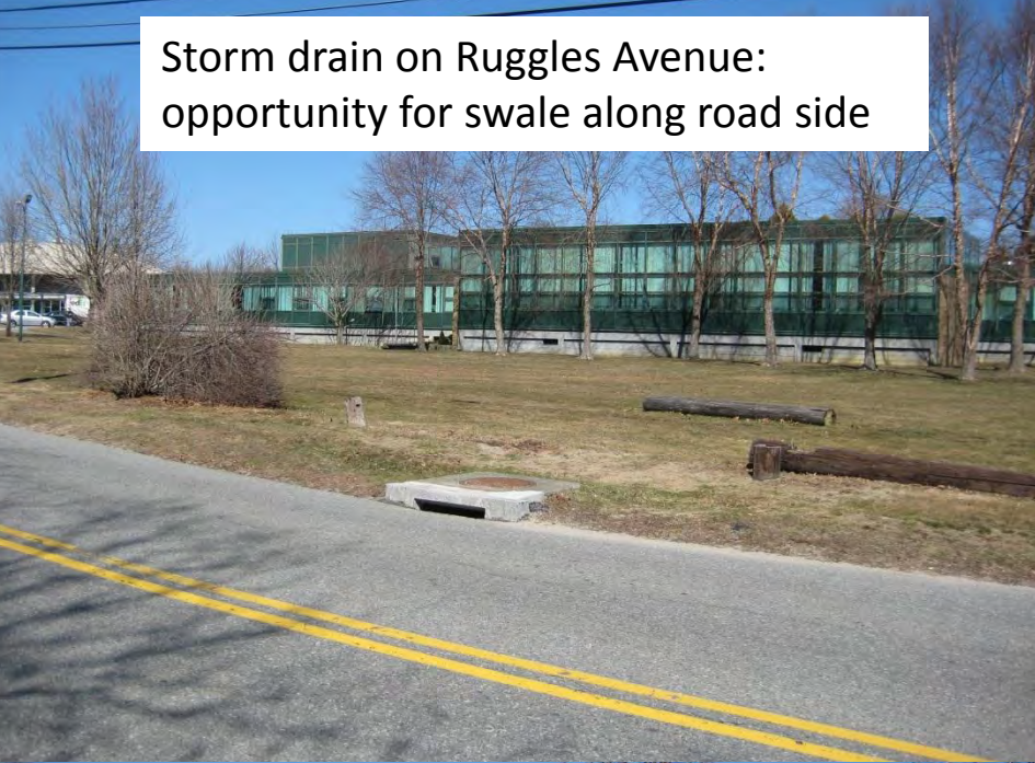
Storm drain on Ruggles Avenue: opportunity for swale along road side