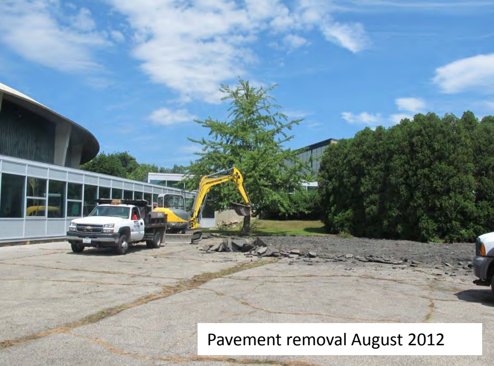
Pavement removal August 2012