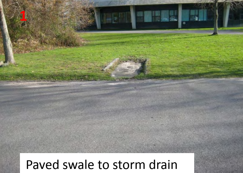
Paved swale to storm drain