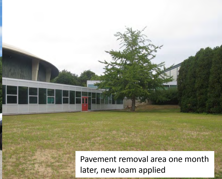
Pavement removal area one month later, new loam applied