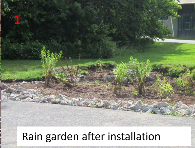
Rain garden after installation